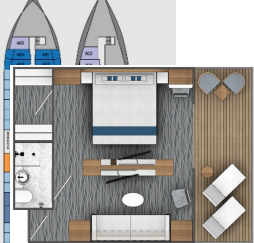
Category C Stateroom - Balcony Stateroom