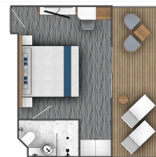
Category D Stateroom - Albatross Stateroom