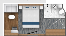
Category G Stateroom - Single Stateroom (Porthole)