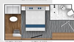
Category G Stateroom - Single Stateroom (Porthole)