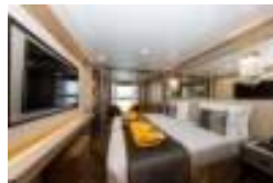
Owner's Suite. From