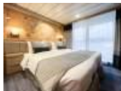
Infinity Suite. From