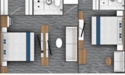
Family Suite - Brynhilde Suite