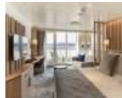
Deluxe Balcony Suite