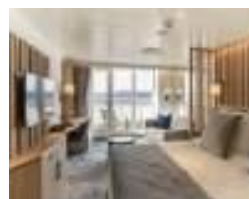
Deluxe Balcony Suite