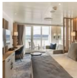
Deluxe Balcony Suite