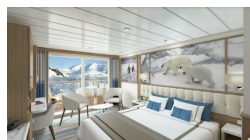
Balcony Stateroom Category A