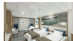
Aurora Stateroom Triple Share