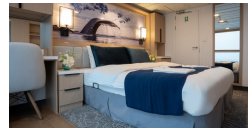
Grand Balcony Stateroom