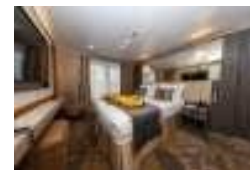
Deluxe Veranda Forward Stateroom