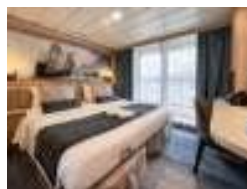
Studio Veranda Single