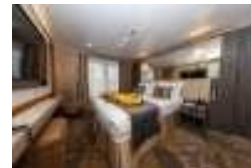
Infinity Suite. From