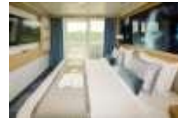
Owner's Suite. From