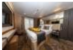
Infinity Suite. From