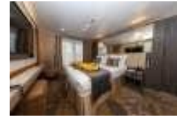
Deluxe Suite Forward Stateroom