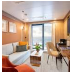
Deluxe Veranda Forward