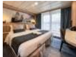
Studio Veranda Single