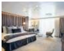
Deluxe Balcony Suite. From