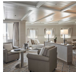
Grand 1 Bedroom