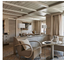
Owner 1 Bedroom